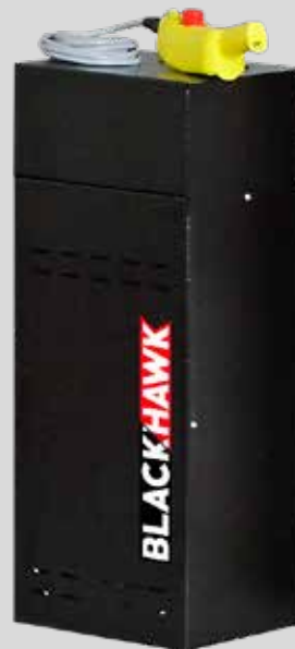
PMPLIFT Electric pump + remote control. Available on request